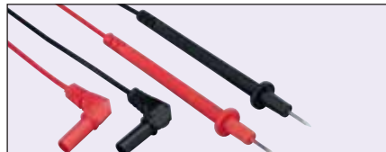
Extra Set HMM-TL general use test lead set, high quality design, $5.

3 1/2 digits 3999 counts DC Volt: 0-400 mV/4/40/400/ 1000 V \pm 0.5\% AC Volt: 0-400 mV/4/40/400/ 750V \pm 1.5\% DC current: 0-40 m/400 mA/10 A \pm 1.5\% AC current: 0-40 m/400 mA/10 A \pm 2.0\% Resistance: 0-400 \Omega /4/40/400/ 4000 k \Omega /40 M \Omega /4000 m \Omega \pm 1\% Capacitance: 0-4 nF/40 nF/400 nF/ 4 \mu F/400 \mu F \pm 5\% Inductance: 0-4 m/40 mH/400 mH/ 4 H/40 H \pm 5\% Frequency: auto-ranging up to 1 MHz \pm 0.5\% Diode test function Continuity: <40 \Omega \pm 20 \Omega 1000 Vdc/750 Vac overload protection 500V overload protection in Diode, \Omega , Hz, Continuity hFE test function Logic probe function